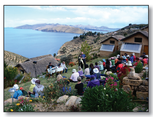
Island of the Sun - Lake Titicaca

The first significant event was the fulfillment of an ancient prophecy where the Eagle meets the Condor. This ancient prophecy dates back thousands of years and was explained in great detail in my book, The Gaia Effect . In essence, the prophecy is in relation to the planet becoming balanced. The northern hemisphere masculine energy would reunite with southern hemisphere feminine energy so that the planet would once again be in balance. The ancients referred to this as the movement of the Kundalini. Several prophecies called it the Journey of the Feathered Serpent, the Awakening of the Puma and the meeting of the Eagle and the Condor. The prophecy stated that the movement of the Kundalini would center itself by 2012. It did!