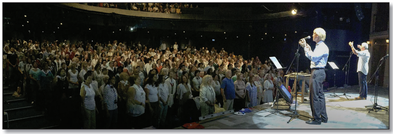
The Peace Choir - Israel

Another startling piece of information that Kryon revealed was that not all of the matched pairs of nodes and nulls ARE PREDETERMINED! The only two predetermined pairs were Maui, Hawaii with Tibesti Mountains, Chad (Africa) and The Island of the Sun, Lake Titicaca, Bolivia (Peru) with Mt Kailash, Tibet. The pairs are matched in response to Human Consciousness. The matching null for Uluru was one of three potentials. All three were appropriate. A polarized pair is determined by the matching energy of the node and null based upon Human Consciousness at a certain point in time at the moment of the matching. After the final tones of The Creation Choir were sung, Kryon announced that the matching null for Uluru was Mount Logan, Yukon Northern Territories, Canada. The result is that we now have five matched pairs of nodes and nulls (time capsules) which are enhancing the delivery of new tools towards spiritual evolution. Watch for a "new normal" on the planet. Expect love, compassion and integrity to matter more now than ever before!