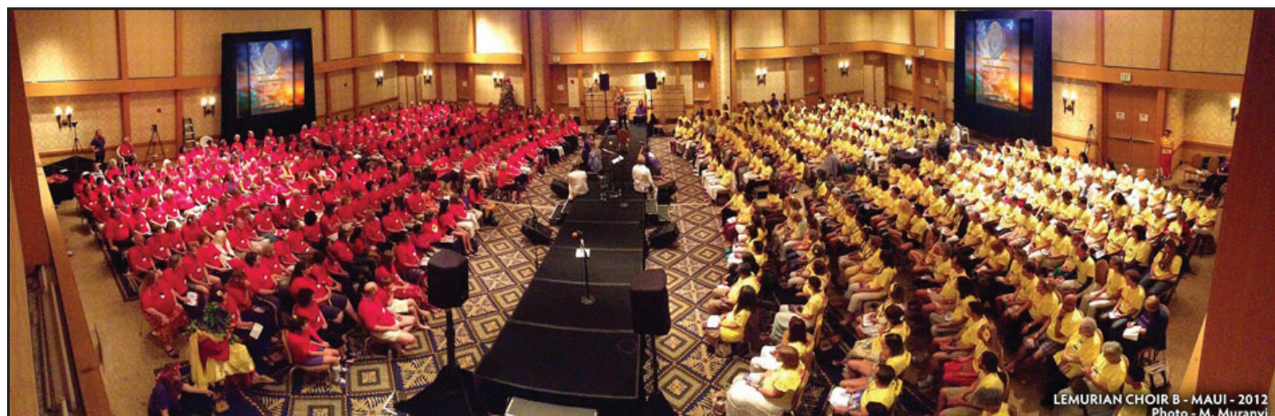
The Lemurian Choir - Hawaii

Why do we need to know about the Pineal Tones and the choir? Kryon has explained that in Lemuria, once a year on December 21, [the solstice] Lemurians got together and sung 12 sets of the Pineal Tones. This created a mass consciousness quantum signal. The signal was sent through the galaxy. This once a year message went out to say "thank you" to our spiritual parents, the Pleiadians. The messages stopped more than 20,000 years ago.