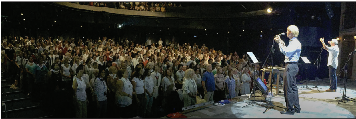
The Peace Choir - Israel

Another startling piece of information that Kryon revealed was that not all of the matched pairs of nodes and nulls ARE PREDETERMINED! The only two predetermined pairs were Maui, Hawaii with Tibesti Mountains, Chad (Africa) and The Island of the Sun, Lake Titicaca, Bolivia (Peru) with Mt Kailash, Tibet. The pairs are matched in response to Human Consciousness. The matching null for Uluru was one of three potentials. All three were appropriate. A polarized pair is determined by the matching energy of the node and null based upon Human Consciousness at a certain point in time at the moment of the matching. After the final tones of The Creation Choir were sung, Kryon announced that the matching null for Uluru was Mount Logan, Yukon Northern Territories, Canada. The result is that we now have five matched pairs of nodes and nulls (time capsules) which are enhancing the delivery of new tools towards spiritual evolution. Watch for a “new normal” on the planet. Expect love, compassion and integrity to matter more now than ever before!