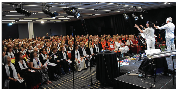
The Avalon Choir - Glastonbury

America is in the Southern Hemisphere associated with the heart, the intuition, and the spiritual, while Spain is in the Northern Hemisphere associated with the brain, the rational, and the material. This matched pair is about transmuting the past and creating a new future. It is about balancing the masculine and the feminine. It represents the prophecy of the Eagle and the Condor where a new level of consciousness for humanity is created.