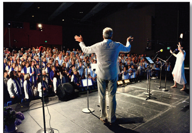
The Celebration Choir - Mt. Shasta