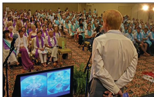
The Crystalline Choir - Arkansas