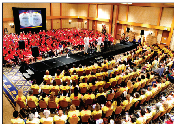
The Lemurian Choir - Hawaii