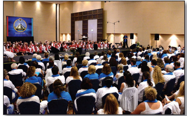
The Compassion Choir - Mexico