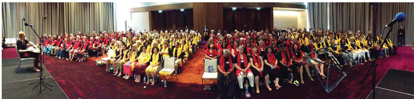
The Creation Choir - Uluru

The significance of these events allowed four matched node/null pairs (time capsules) to be identified, opened and activated so that ALL of the twelve time capsules could receive the push-pull energy that is being transmitted from the Great Central Source. Out of the twelve, four are then broadcasting the transmissions to humanity via the grids. As each of the remaining time capsules are individually identified and activated, they will join the others in broadcasting the transmissions they are receiving.