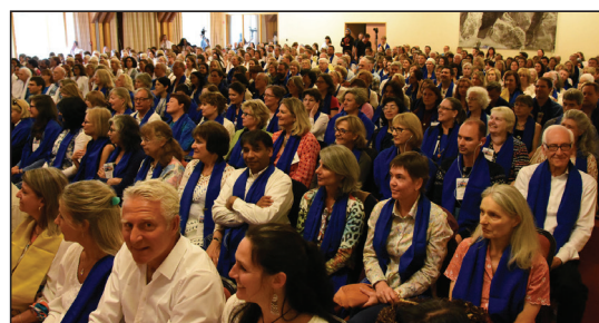
The Quantum Choir - Mount Blanc

During May 21, 2017 Dr. Todd Ovokaitys held The Quantum Choir in Chamonix, France (located at the base of the Mont Blanc Massif) and the eighth matched node/null pair was identified as Mont Blanc, France/Italy/Switzerland with Mt. Aconcagua, Argentina. This pair represents a beautiful example of the meld and unification between the northern hemisphere and the southern hemisphere. This is a metaphor of the balance between the divine masculine and divine feminine on the planet.