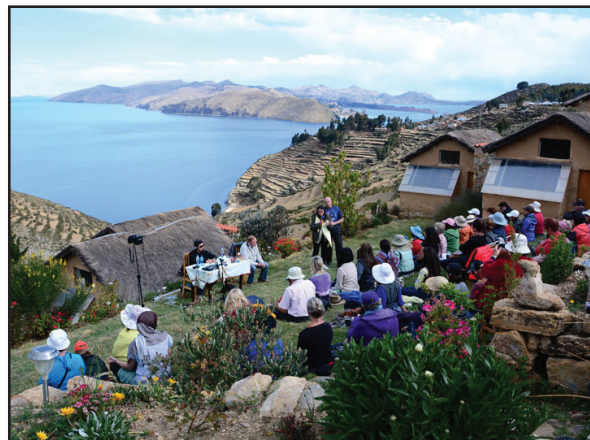
Island of the Sun - Lake Titicaca

Earlier I mentioned that the Pleiadians set energy within the time capsules, ready for release should humanity ever reach a certain vibration, and in 2013 we reached that vibration. While on the Island of the Sun in Lake Titicaca (a node), Kryon revealed that the first time capsule on the planet was ready to be activated and opened. The matching null was given as Mt Kailash in Tibet. This time capsule was waiting to be opened in the year of the six. The year of the six refers to the numerology of 2013. In Ancient Tibetan numerology, six represents sacredness, communications, harmony, balance and love (also the Higher-Self).