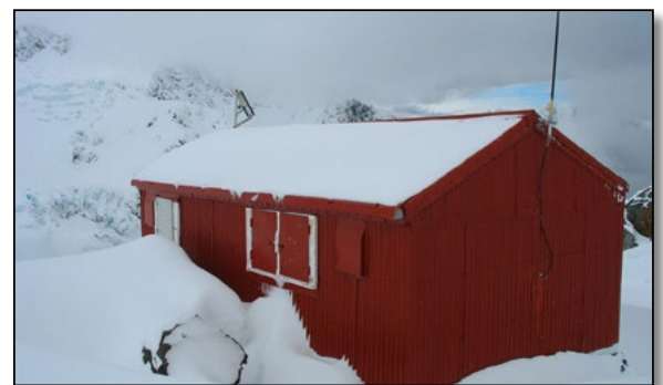
Almer Hut – Franz Josef Glacier

On the morning of our trip I woke to heavy rainfall. In fact, every day for the last three weeks it had rained. It didn't look good. After receiving some phone calls, I insisted that everyone still come to my place as planned. If it cleared up we would fly in, and if not we would just celebrate and have a girls' night in at my place. No one really expected the weather to clear but I was optimistic. A few hours before the scheduled trip the weather cleared. However, there was a new problem. The forecast didn't look good and there was a genuine concern that even if we could fly in there was no guarantee we could fly out the next day. If the weather turned it could be a week or more before we could get out. I knew there was a high possibility that we would be stuck in the hut but this feeling that came over me said that everything would be alright. It was like a voice saying to ignore the fear and listen to what my heart said. My heart said to go for it! As soon as I stated that I was going to the hut and I would even go on my own if no one else was interested it was like a trickle effect, and one by one everyone else agreed.