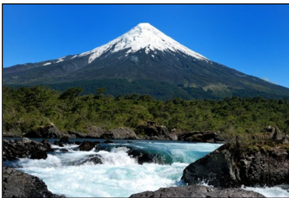
Osorno Volcano – Patagonia Cruise

perfect weather. Nearly every tour guide we encountered kept saying “you guys don't know how lucky you are with the weather.” All of the Kryon attendees would simply nod and smile and wink at each other because we